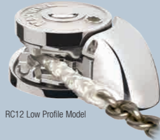
RC12 Low Profile Model