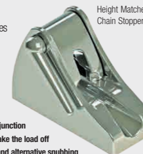
Height Matched Chain Stopper

Important: Maxwell windlasses must be used in conjunction with a chain stopper or alternative snubbing device to take the load off the windlass while laying at anchor. The chain stopper and alternative snubbing system should also be used to secure the anchor in the fully raised position while under way.