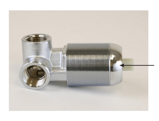
Unscrew this chrome cap ring from the faucet body.